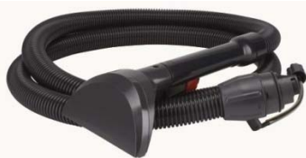
Optional Accessory Pack 30G3 Hose & Upholstery Tool